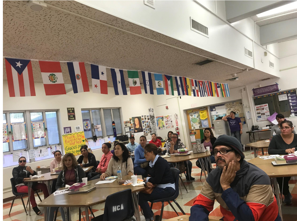
Counselors sharing data and the programs they do with our students